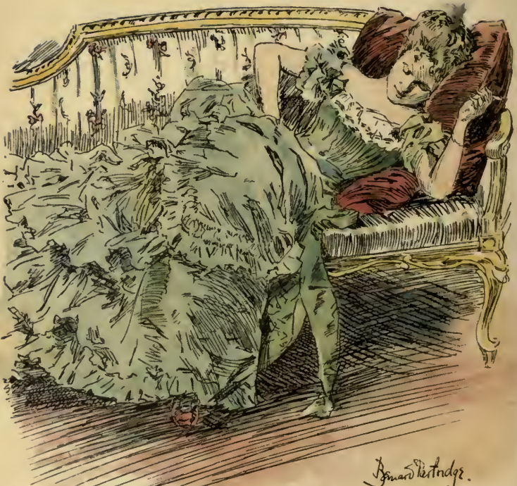
Leaning back on the red velvet cushion of a sofa.